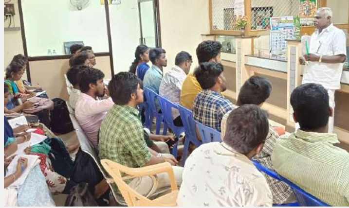
Poondi, Madurai PACCS