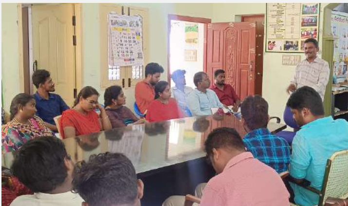
Viruthai Millets, Virudhunagar