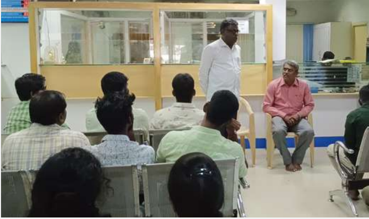
Othakkadai Urban Cooperative Bank , Madurai