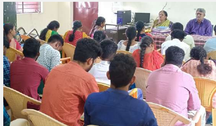
Urban Cooperative Bank, Thirumanagalam