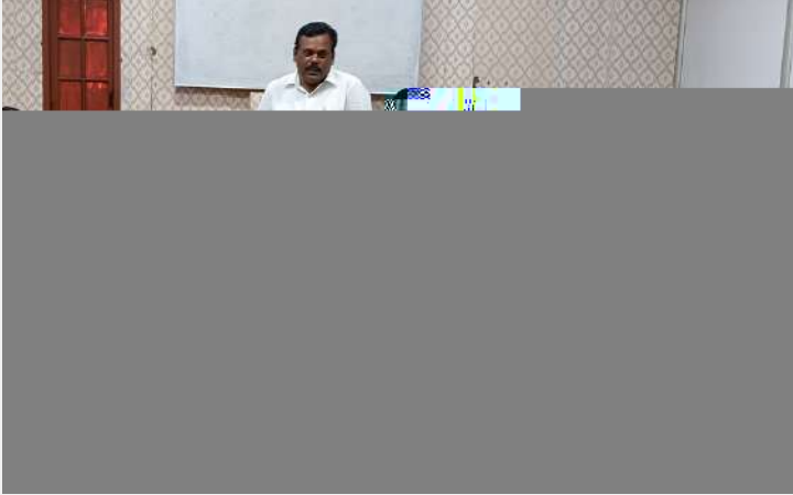
MDCC Bank, Madurai