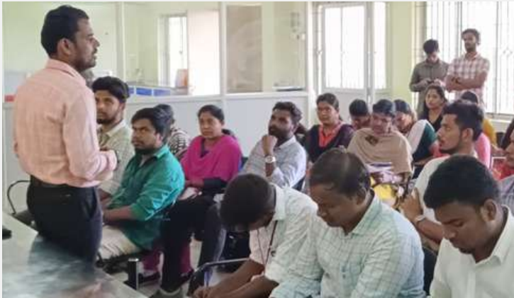
E- NAM, Madurai

As a part of the HDCM Programme, the participants of 54th batch of our institute has undertaken field visits to various cooperatives in Tamilnadu from 8th - 19th May, 2023. The participants have gained practical knowledge and experienced field observations about the functioning of cooperatives.