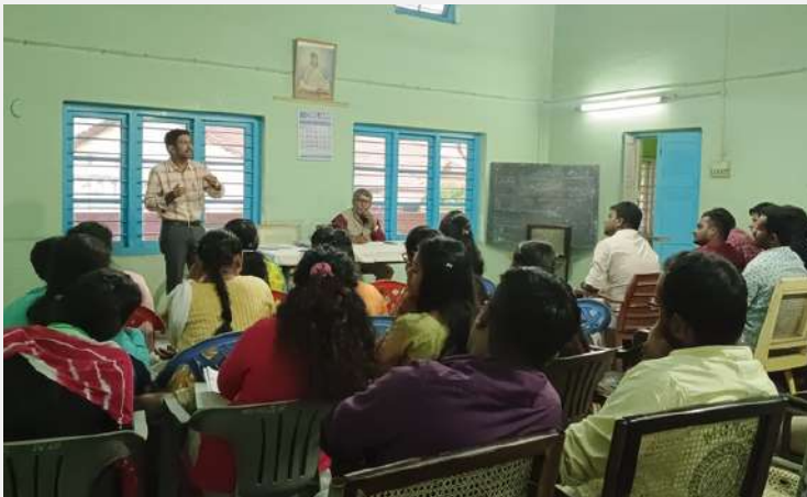
MDCC Bank Ooty