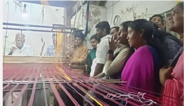
Weaver's Cooperative, Madurai